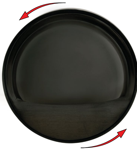
Twist To Lock Function Tool Free relamping.

Wiring: Fixture is prewired with a 18-2 SPT1-W direct burial cord. Wire connector sold separately. Silicone filled wire nut ( CX-854 ) are available from Corona Lighting. Gasket: Silicone "O" ring seals face plate to housing providing weather tight protection Electrical Notes: A remote 12V transformer is required. Options are available from Corona Lighting. Voltage range for LED lamps are 8V-21V. Proper grease/lubricant is suggested on threaded parts during installation process. Warranty: Limited lifetime warranty on fixture against manufacturer's defects.