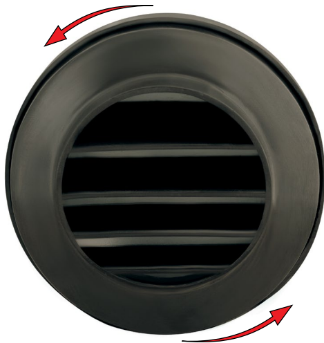
Twist To Lock Function Tool Free relamping.

Wiring: Fixture is prewired with a 18-2 SPT1-W direct burial cord. Wire connector available separately. Silicone filled wire nut ( CX-854 ) is available from Corona Lighting. Gasket: Silicone "O" ring seals face plate to housing providing weather tight protection Electrical Notes: A remote 12V transformer required, may be ordered to Corona Lighting separately. Operating voltage range for LED lamps the range is 8-21V. Warranty: Limited lifetime warranty on fixture against manufacturer's defects.